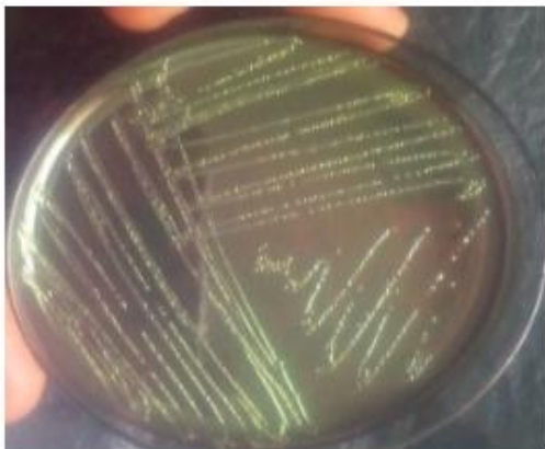
Plate I: Pure Colonies of E. coli on EMB Agar

Plate I show the pure colonies of E. coli on Eosine Methylene Blue (EMB) agar with clear greenish metallic sheen. A total of 258 samples were collected and a total of 237 bacteria were isolated. Figure 1 shows the prevalence of Escherichia coli in comparison to other bacteria isolated. With E. coli having a prevalence rate of 24%.